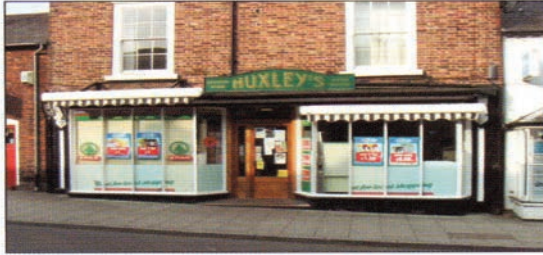
Huxley's Country Store 13, High Street, Malpas, Cheshire 01948 860352

The bakery serves homemade products such as pies, pasties, breads, cakes and sandwiches. They also sell fresh vegetables, cooked meats (including spit-roast chickens), cheeses and general groceries and wines & spirits.