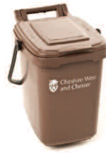
Food waste bin