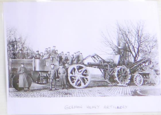
GERMAN HEAVY ARTILLERY